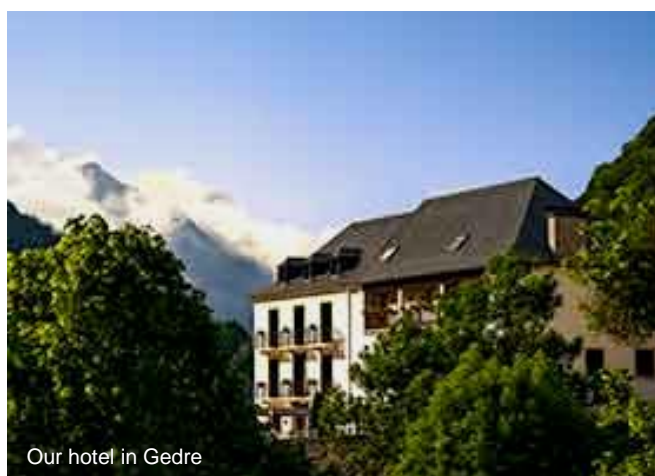
Our hotel in Gedre