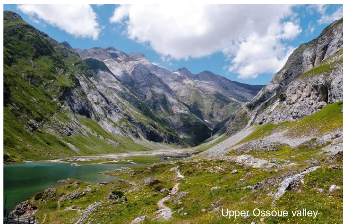
Upper Ossoue valley

We spend a full day walking in the Ossoue Valley which is perhaps one of the best areas for both birds and plants. Griffon Vulture, Lammergeier, Golden Eagle and other birds of prey all breed here on the high limestone cliffs, while along the valley we may see Ring Ouzel, Northern Wheatear, Dipper, Rock Bunting, Rock Thrush and Red-backed Shrike. Flowers will include Ramonda myconi , on shaded rocks, drifts of Marsh Orchids in the wet valley bottom and the delicate Rush-leaved Daffodil Narcissus assoanus . Butterflies can be abundant in sheltered spots, lizards bask on sunny rocks and Alpine Marmots are common and easily observed. At the head of the valley, we walk around the barrage, where alpine flowers enliven the turf, below a panorama of high ridges. Up to 5kms.