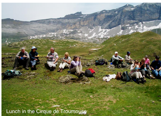
Lunch in the Cirque de Troumouse

In order to book your place on this holiday, please give us a call on 01962 733051 with a credit or debit card, book online at www.naturetrek.co.uk , or alternatively complete and post the booking form at the back of our main Naturetrek brochure, together with a deposit of 20% of the holiday cost plus any room supplements if required. If you do not have a copy of the brochure, please call us on 01962 733051 or request one via our website. Please stipulate any special requirements, for example extension requests or connecting/regional flights, at the time of booking.